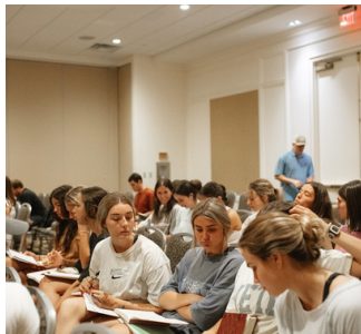
BIBLE STUDY TRAINING