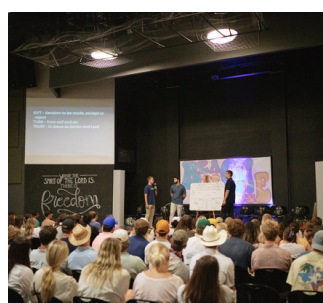
CHURCH & OUTREACH TRANING