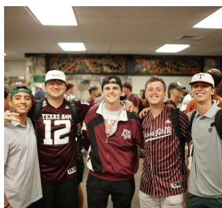
D-GROUP NIGHT & CAMPUS TIME