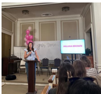
WORLD PRAYER & GIRLS/GUYS TIME